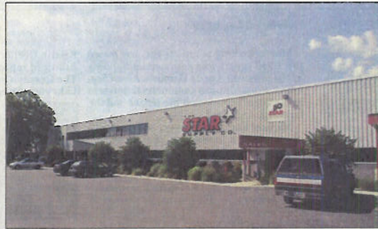
ABOVE: Entryway to Star Supply, a distributor of heating, air conditioning, ventilation, refrigeration and sheet metal products at 118 Gando Drive in New Haven.