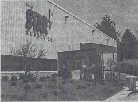
Exterior of the new 118 Gando Drive facility.