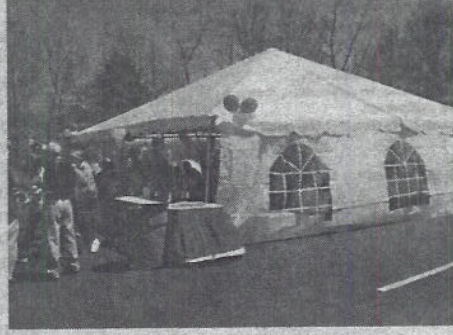
Gathering at the tent during the festivities.